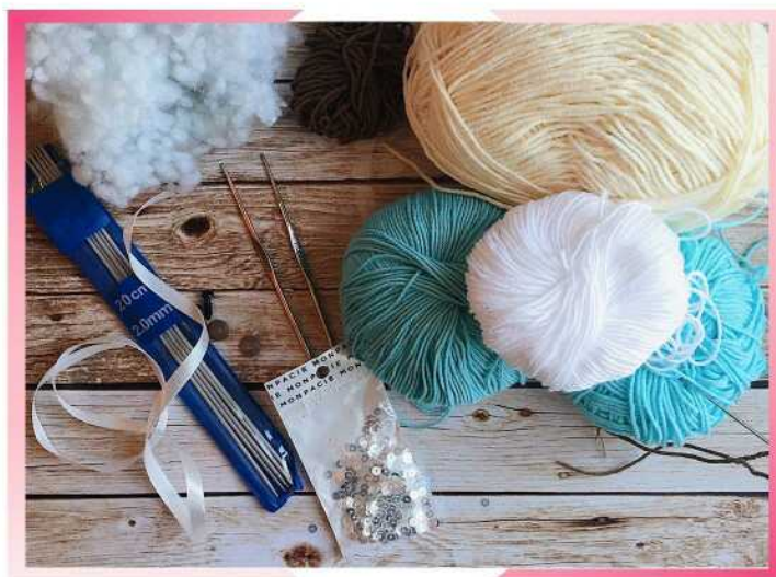
Prepare all materials for making a sheep