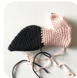
1. Beak and Face completed.