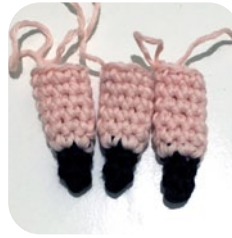
11. Three toes lined up.

Fasten off, leave a tail for sewing. Add a bit of stuffing.