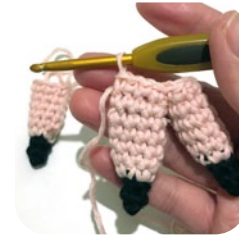
12. Work 4sc across the middle toe.