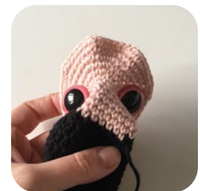
4. Check that the eyes are matching position on both sides of the beak.