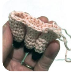
14. Carry on working around to complete the round.