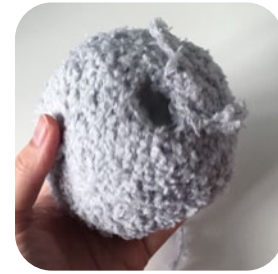
6. Add stuffing, not too dense to keep it squishy.