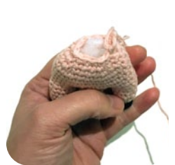
19. Add stuffing to the toes and the foot, continue crochet.