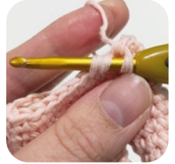
16. For an invisible decrease take the front loops of the two stitches.