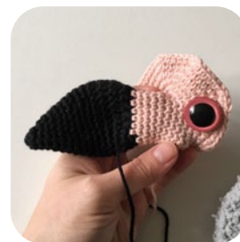
3. Add safety eyes between Rnd 26/27 align to centre of the beak.