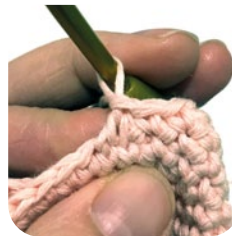
17. Pull the yarn through both loops - the decrease looks like a single crochet!