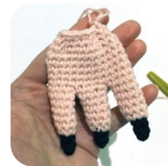
18. The main foot section is complete.