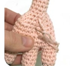
21. Shape the foot - using the pink yarn.