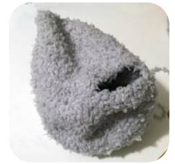
9. Turn the body wrong side out and add the neck.