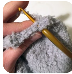
7. Pinch together the end of body, sl st through it.