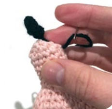
20. Sew the talon to the tip of the back toe.