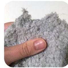
8. The end once sewn up with slip stitches.