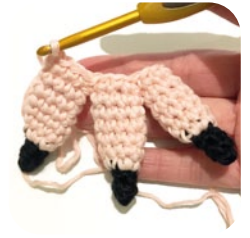
13. Work 8sc around the third toe.