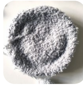
5. Head will look like a large fluffy circle.