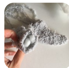
22. Add a little bit of stuffing to the wings.