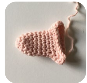
2. Lower Jaw completed.