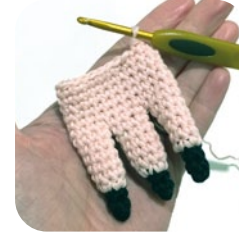
15. Work 5 more rounds of 24sts, then start decreases.