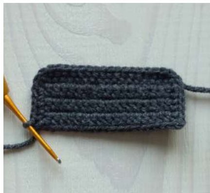
Work along 3 sides