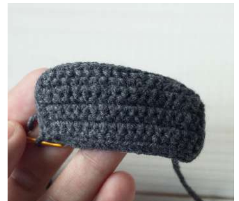
Then crochet the round 9 into back loops

R9. Crochet around the piece in a spiral. The round 9 is crocheted into back loops only: 18sc, then 32sc into the stitches we worked in the round 8 (50)