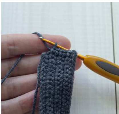
Crochet across the edge