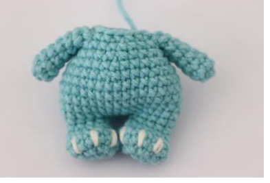
Speckles (make 3) 7sc in mr

*Let a bit yarn for sewing and cut the yarn.