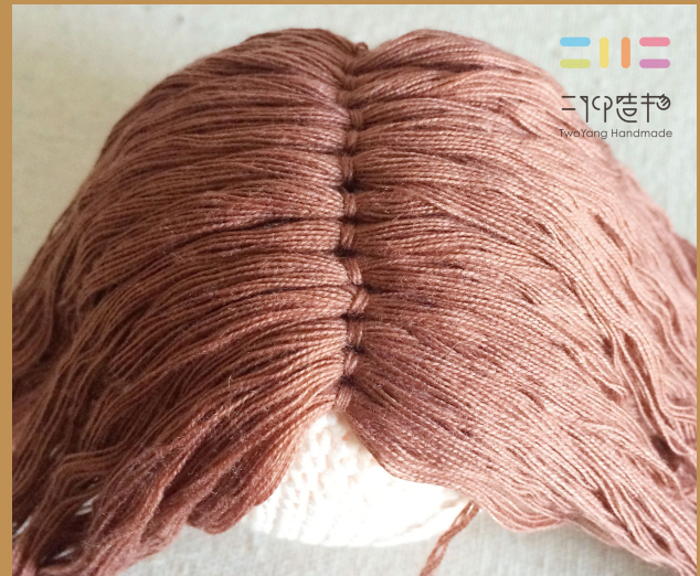
10. Repeat the above steps to sew a row of hair.