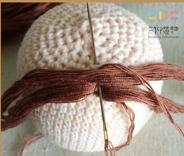
9. Insert the needle as shown in picture, pull to tighten it.