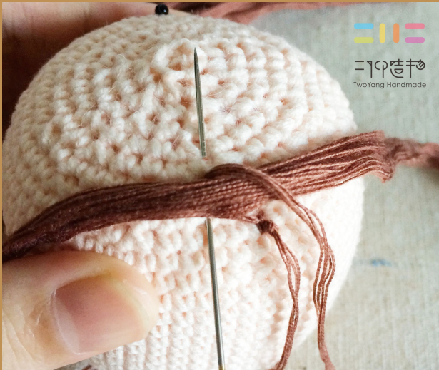
7. Again, insert needle to the place where the pin previously located. Pull the needle through at 2-row intervals (as shown in picture).