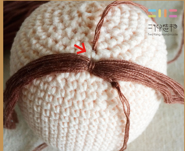
8. Pull to tighten it. Put hair at the place pointed by arrow.