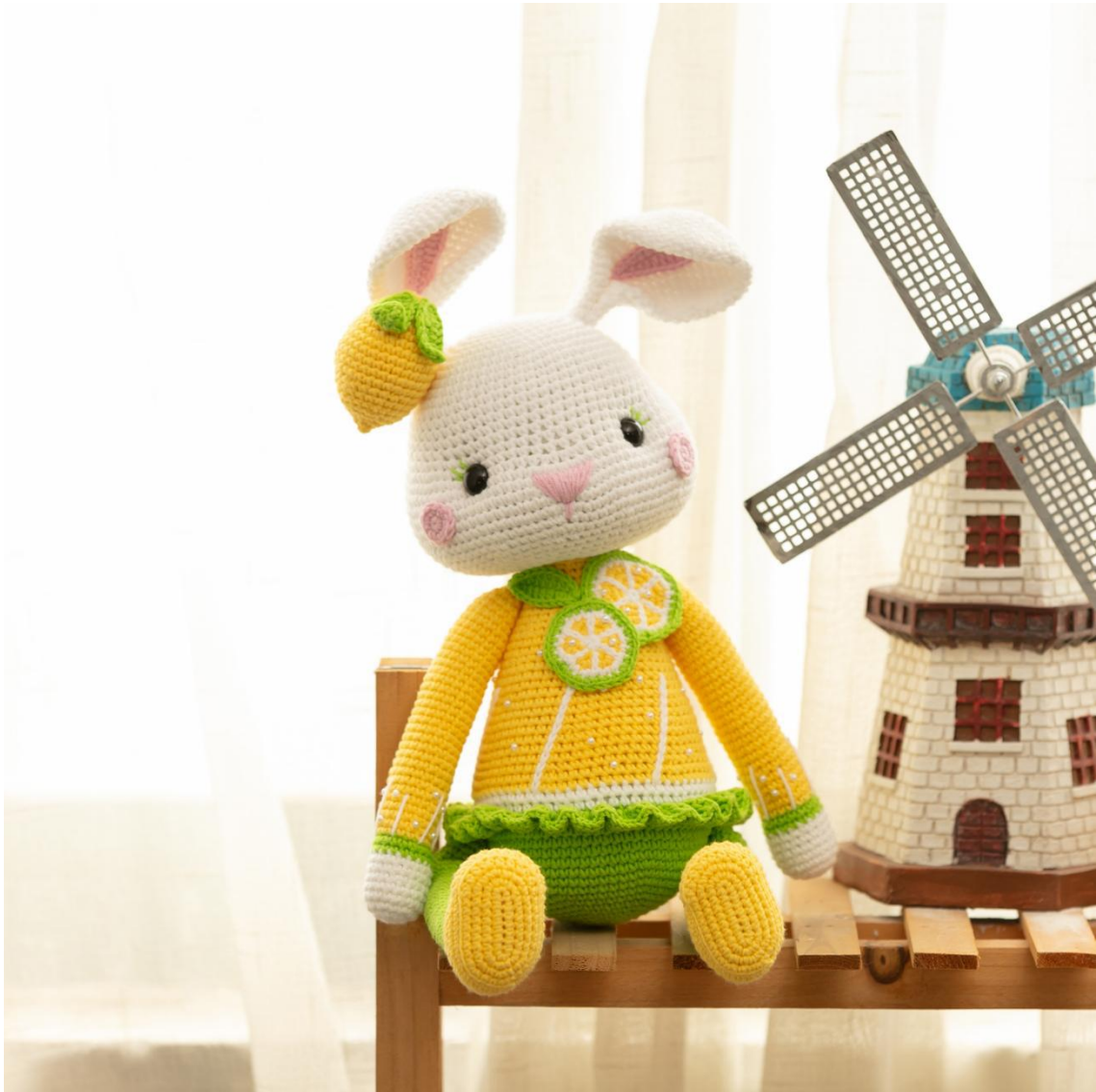
Cuddle Bunny – Fresh Lemon Bunny Crochet Pattern

Copyright © KaiaCrochet All rights reserved